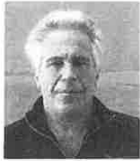
JEFFREY E EPSTEIN

This information is for the following offender: